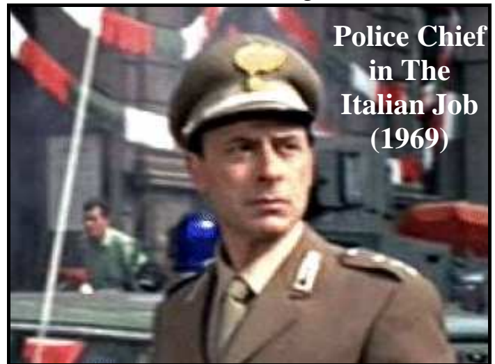
Police Chief in The Italian Job (1969)