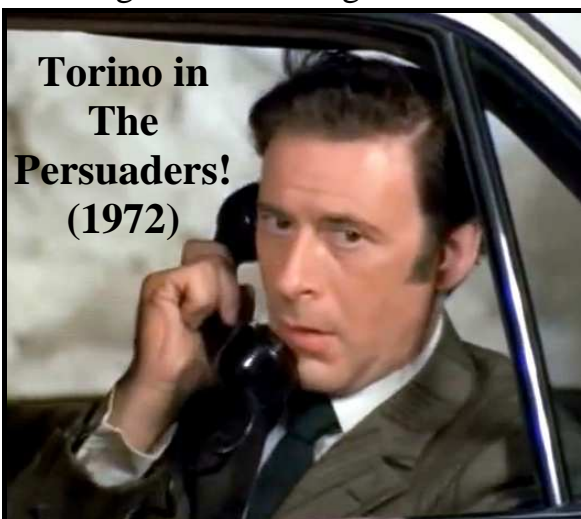
Torino in The Persuaders! (1972)